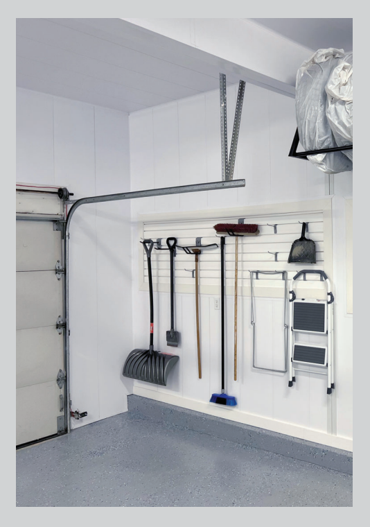
Where function meets style!