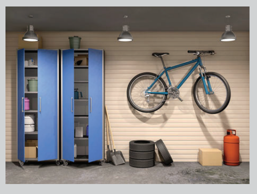
Kodiak Slatwall is great for residential, commercial & industrial spaces!